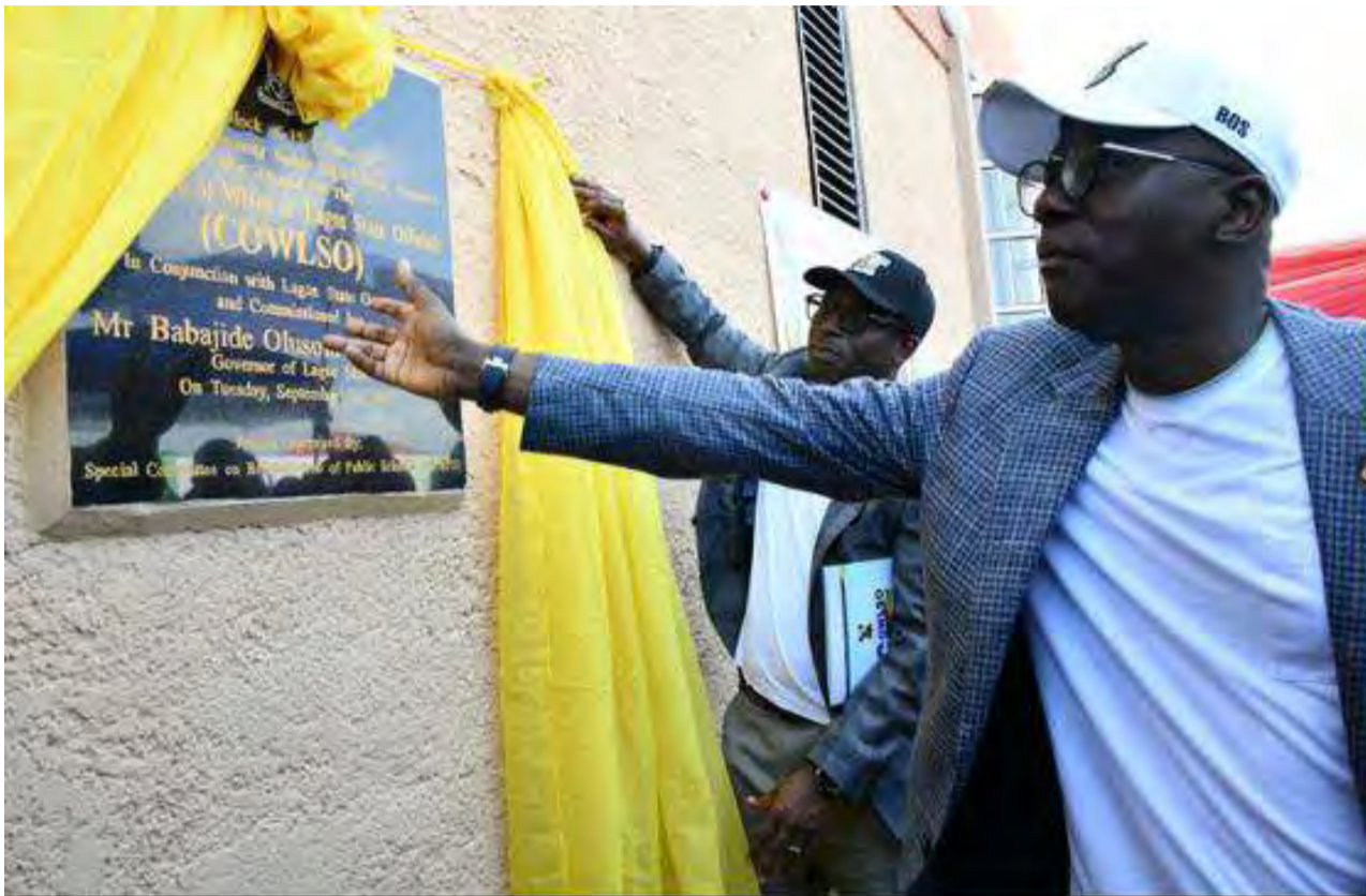
Gov Sanwo-Olu inaugurating one of COWLSO'S projects in Eti-Osa

C ommittee of Wives of Lagos State Officials (COWLSO) has delivered an intervention that will bolster education in the underserved Ogombo community, Eti Osa area of Lagos State.