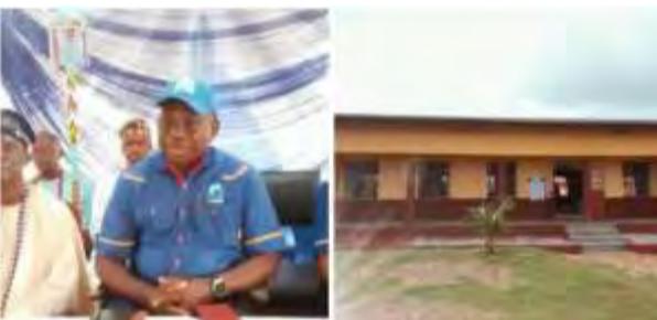
Project commissioned in Epe grammar school

Association of Lagos State Retired Heads of Service and Permanent Secretaries (ALARHOSPS) has celebrated her 10th anniversary with the commissioning of rehabilitated hall at the Epe Grammar school.