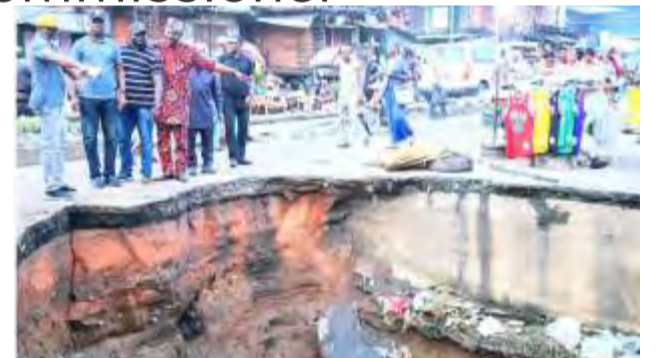
(Commissioner of Works during the inspection of damaged Ikotun road)

He said his Ministry and that of Works and Infrastructure would move fast to fix the Ikotun Primary Channel and ensure