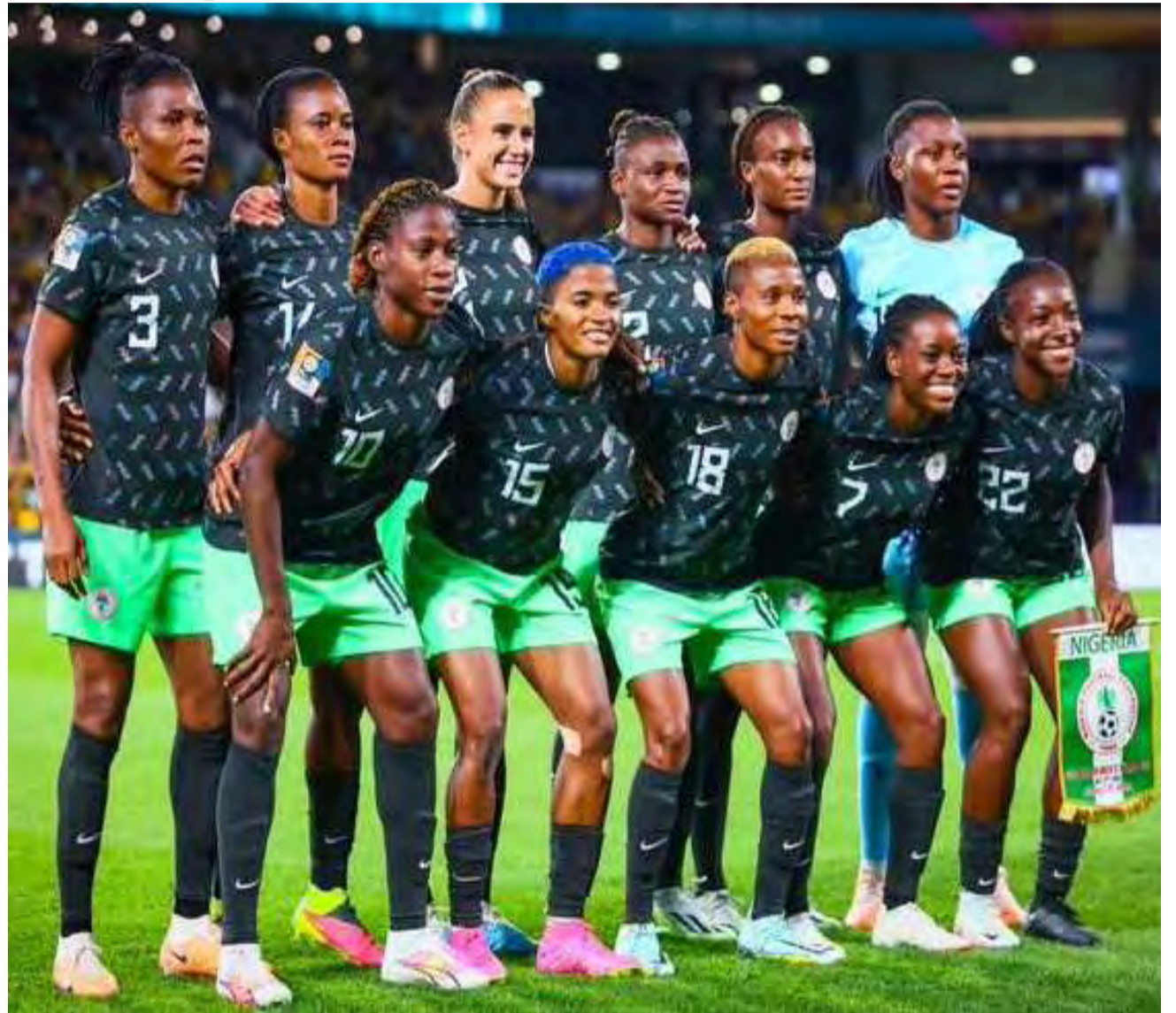
Super Falcons at the last FIFA Women's World Cup in Australia