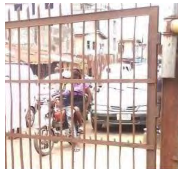
A gated street in Somolu LG

"Both transportation and environment are prominent areas in the Governor Babajide Olusola Sanwo-Olu's T.H.E.M.E.S agenda and every responsible individual in Lagos State must comply with."