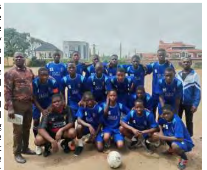
A participating school group picture with technical crew

the disciplinary committee found them guilty, such schools would be fined and disqualified." The tournament have served as a preparatory ground for schools ahead of the state and nationwide Principals Cup.