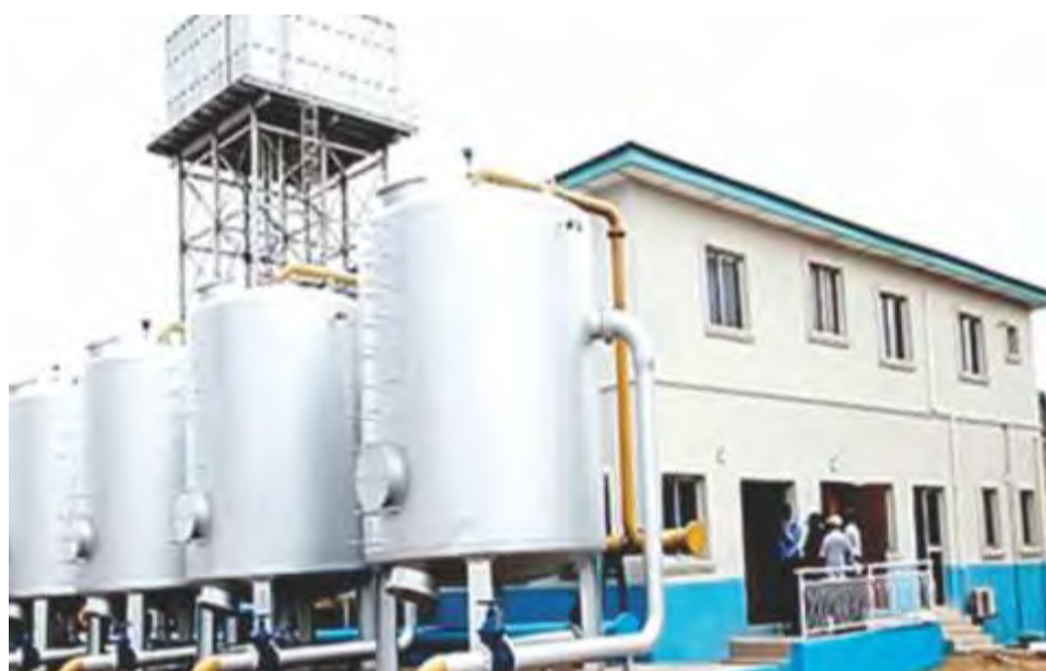
Lagos Water Corporation