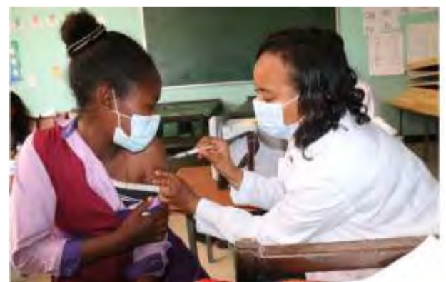
(Schoolgirl being vaccinated against Human Papilloma Virus (HPV))