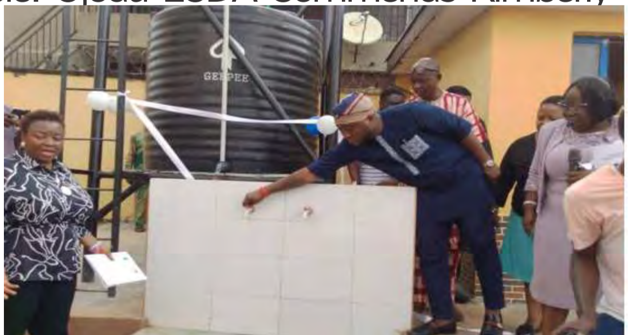
The borehole donated by Kimberly Clark Foundation

Furthermore, provision of the WASH facilities corroborated the efforts of the Chairman towards the provision of more livable and conducive environment for all and sundry through his